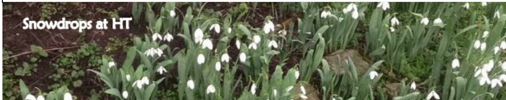
Snowdrops at HT